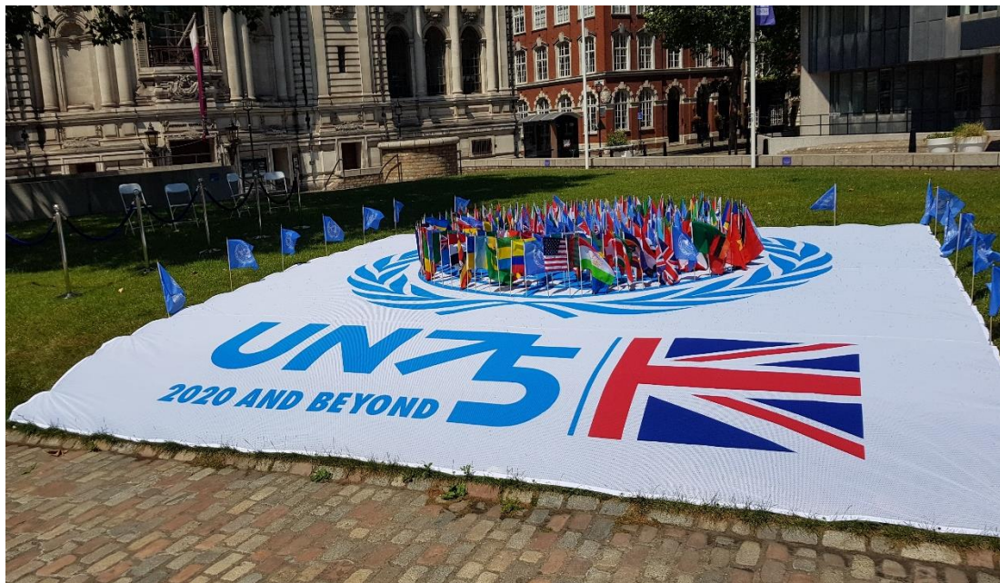
The world's largest UN75 banner featuring the flags of the 193 UN Member States, installed on Broad Sanctuary Green in front of Methodist Central Hall Westminster to mark the seventy-fifth anniversary of the signing of the UN Charter in San Francisco on 26 June 1945