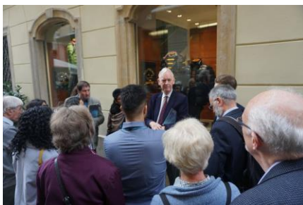
"Return here at 1300 for Peace Museum!"