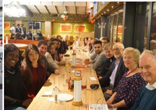
Dinner, Luftburg restaurant