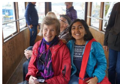
....but just time to ride the Reisenrad!