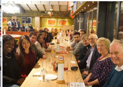
Dinner, Luftburg restaurant