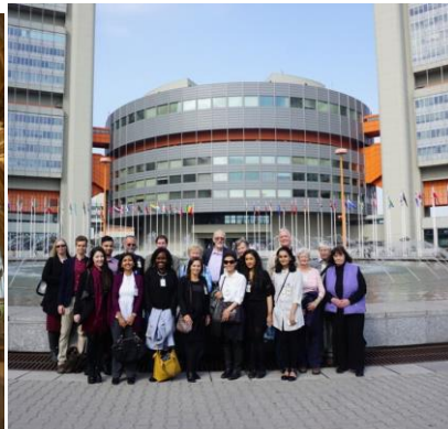
Arrival at Vienna International Centre