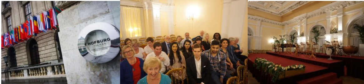
OSCE meeting at the Hofburg