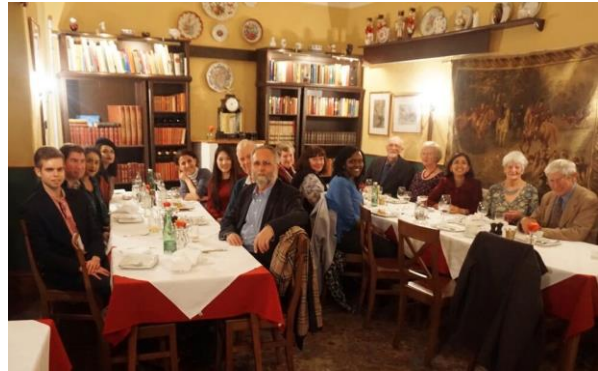
Farewell dinner at the historic Griechenbeisl restaurant

Several younger members of the Study Group were granted bursaries to assist their participation. UNA Westminster is grateful to the UNA London & South East Region Trust for its generous assistance in this and it also granted bursaries. The individual reports of those receiving bursaries will be posted on this site at a later date.